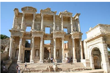
Library of Celsus, Ephesus, Turkey