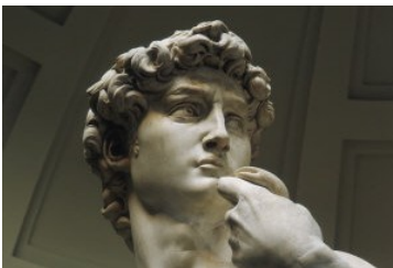
Michelangelo's David in Florence, Italy