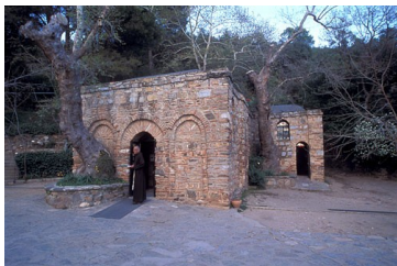
House of the Virgin Mary, Ephesus

Heraklion (Iraklion), Crete —Iraklion, the capital city of Crete, rests on the side of a hill overlooking the Cretan Sea. The city is named after Hercules (Herakles, or in Modern Greek, Iraklis). Though a bustling metropolis, Iraklion is also the gateway to the nearby stunning ancient ruins of advanced civilizations. Visit the great Minoan ruins of the Palace of Knossos and the Archaeological Museum housing many superb artifacts from the complex. Explore the stunning mountain-fringed Lassithi plateau with its orchards, 7000 windmills and ancient villages. Simply relax and watch the people stroll by at one of many outdoor café's in this wonderful port. An abundance of new adventures are waiting for you.